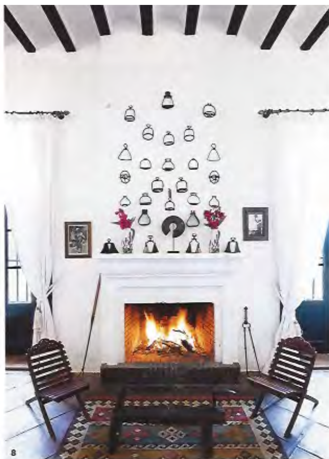
Clockwise from top: Get cozy at the Hacienda De San Rafael in Seville, Spain. Open-air bathing at the Berkeley River Lodge in Kimberley Coast, Australia. Aerial view of the Berkeley River Lodge in Kimberley Coast. The Gorge River in Kimberley Coast