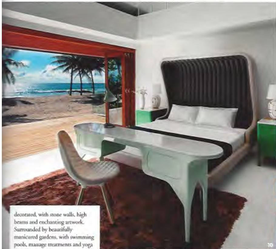
Clockwise from left: Sleep seaside at the Iniala in Phangnga Province, Thailand. One of the three luxury villas located on Iniala, Sand Spit beach on the private paradise in Ibo Island Lodge in Quirimbas Archipelago, Mozambique.